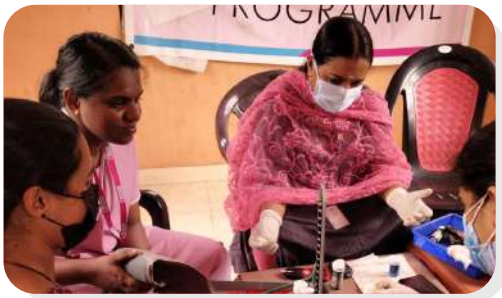
Adolescent health programme in association with Subcenter, Nalpathimala, Athirampuzha on 24/03/23