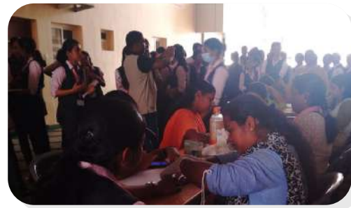
Adolescent health programme in association with Family Welfare Center, Ettumanoor on 19/05/23