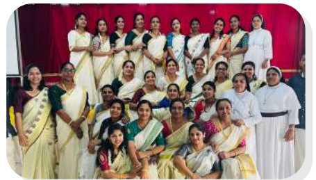
Teachers day celebrations : 02/09/22