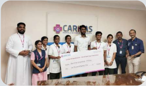
Winners of World heart day all Kerala short film competition conducted on 29/09/2022