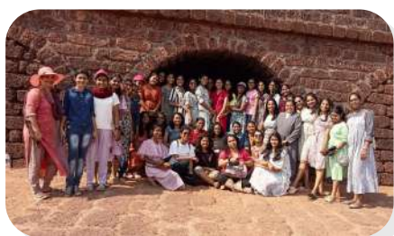
Outgoing BSc Nursing students to Goa on 20/02/23