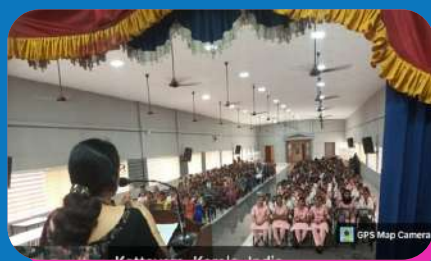
Monthly General assembly