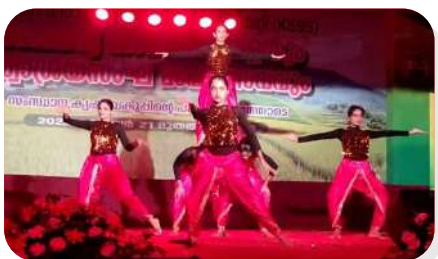
Students participating in Chaithanya Karshikamela: 22/11/2022