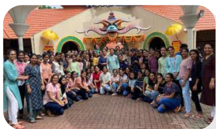
I semester BSc Nursing students to wonderla on 31/08/22,