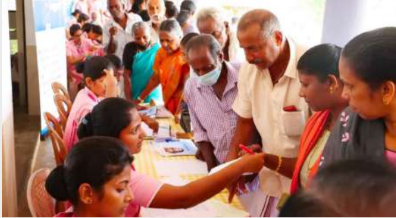
Medical camp at Nalpathimala Church, Athirampuzha Panchayath on 20/11/22