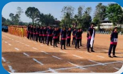
Sarang Sports Fest "Kuthippu" on 15/10/2022