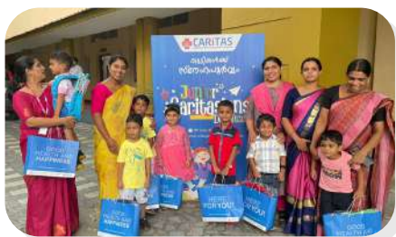
Junior Carithasians programme: 31/05/23