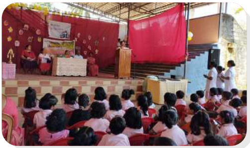
School health programme at St. Aloysius L.P School, Athirampuzha on 29/09/2022