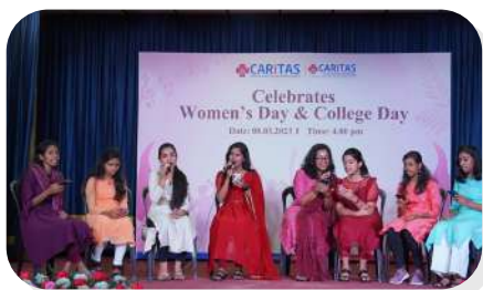
College Day: 08/03/23