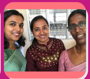
Farewell of Outgoing students on 27/04/23