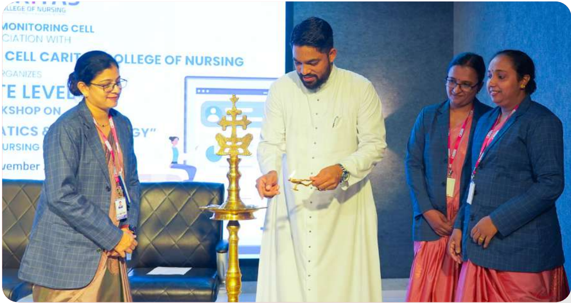
State level workshop on “Health Informatics and Technology” organized by Academic monitoring cell and Internal Quality Assurance Cell on 18/11/22