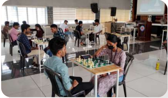
Inter college chess competition on 17/06/23