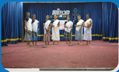
Sarang Arts Fest “Thillana” on 05/12/2022