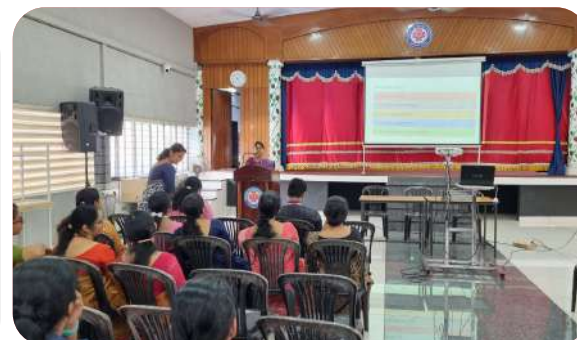
QAS Resensitization programme on 24/04/23 for faculty and students