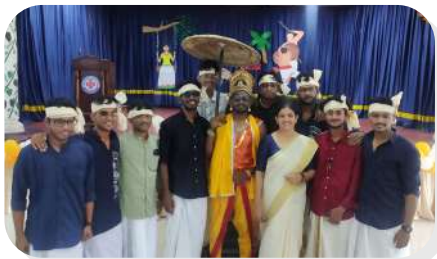
Onam celebration: 02/09/22