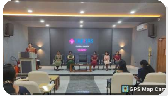
SNA East Zone General body meeting on 08/06/23