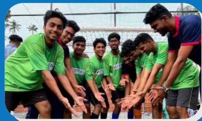
SNA zonal sports competitions on 06/01/2023