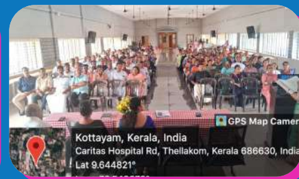
PTA General body meeting on 24/06/23