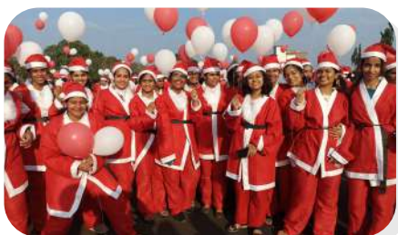
Christmas celebration "Buon nathale": 17/12/22