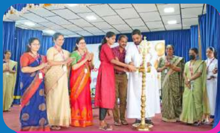
Course inauguration on 28/11/22