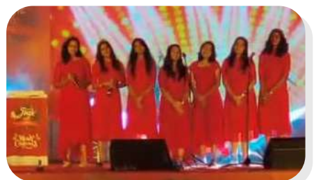
Christmas celebration "Jingle fest": 17/12/2022