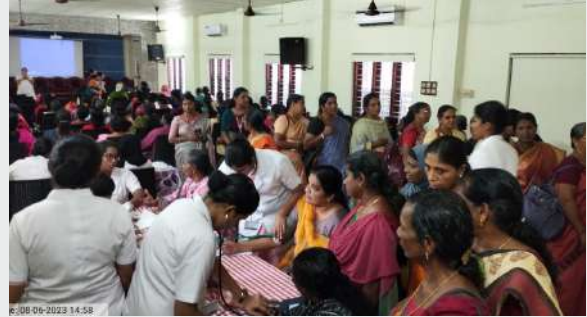
Medical camp in collaboration with NSS and KSSS(Chaithanya) on 08/06/23