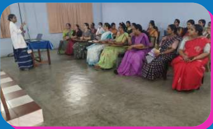
Continuing Education Programmes