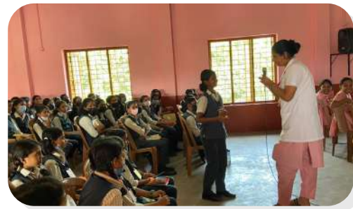
School health programme at Holy Cross HSS, Thellakom on 08/11/22