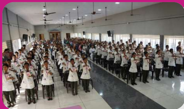
Lamp Lighting ceremony of 21st Batch BSc Nursing: 10/02/23