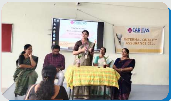
Hands on skill training workshop on use of Information Communication Technology - “Teachnova” for faculty from 21/10/22 to 04/11/22