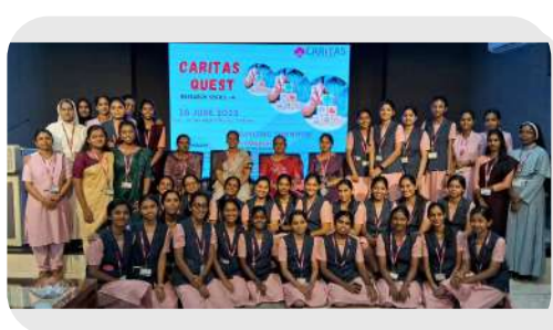
Workshop on "Research Methodology" for 3 rd year BSc and 2 nd year PBBSc Nursing students conducted on 26/06/23 organized by Research Cell and Sarang