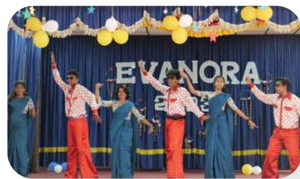
Freshers Day: 18/01/23