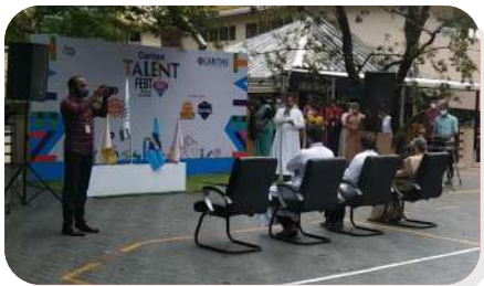
Caritas talent fest: 27/08/22