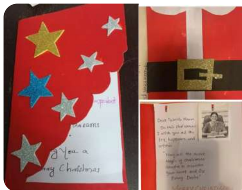
Hand made Xmas cards were sent to all faculty