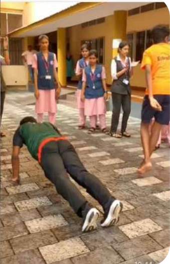
“Run Caritas Run” Fitness competition organized by NSS unit

“Skip a coffee and help a needy” programme aimed to welfare of disabled, poor and sick. 10/10/2023