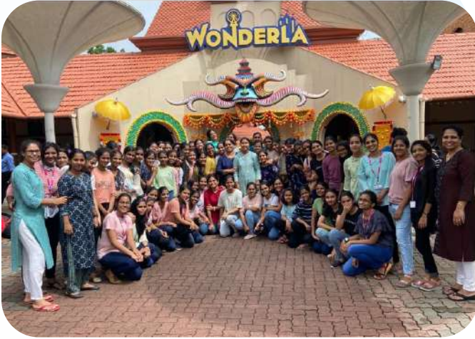
3rd year B.Sc.Nursing WONDERLA, ERNAKULAM