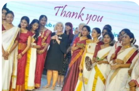
Course inauguration of first semester B.Sc.Nursing 2023 batch