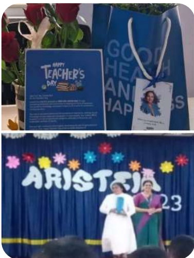
Teachers' Day of college of nursing was celebrated as a tribute to the mentors who ignite the minds of the students and spark a love for learning.