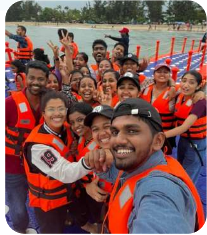
3rd semester B.Sc. Nursing ATHIRAPPILLY, THRISSUR