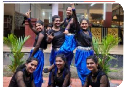
Transforming Chaithanya auditorium into a stage of cultural brilliance. Students of Caritas College of Nursing performed enchanting program, weaving together traditions and tales through dance, music, and laughter

Gathering under the banner of unity – Caritas College of Nursing's Monthly General Assembly is conducted on 3rd Wednesday of every month.