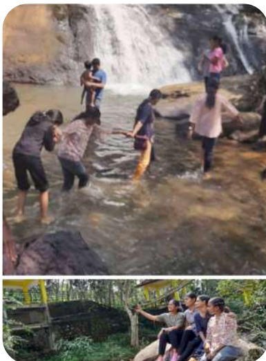
1 st year P B B.Sc Nursing ARUVIKUZHLY WATER FALLS, PALLIKKATHODU