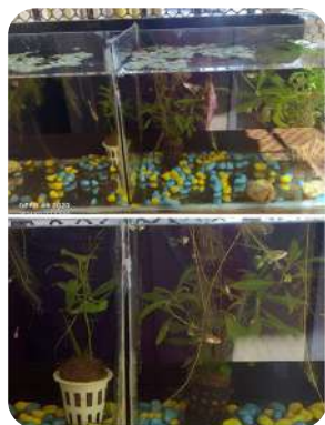
Eco-friendly activity project: Ornamental fish cultivation