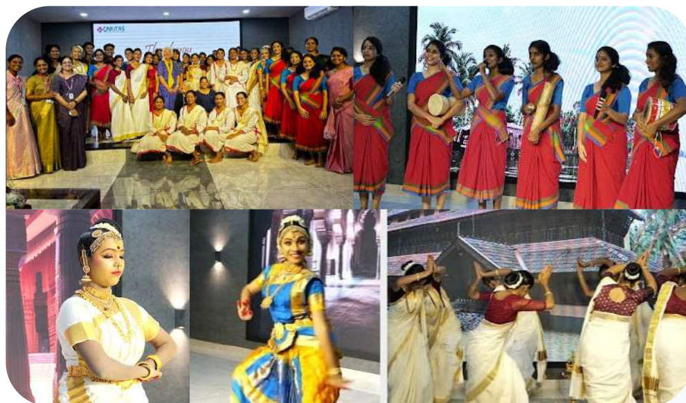
Caritas College of Nursing was honored to host our international friends and they were treated to a spectacular cultural programme, curated with passion and talent by the Arts Club