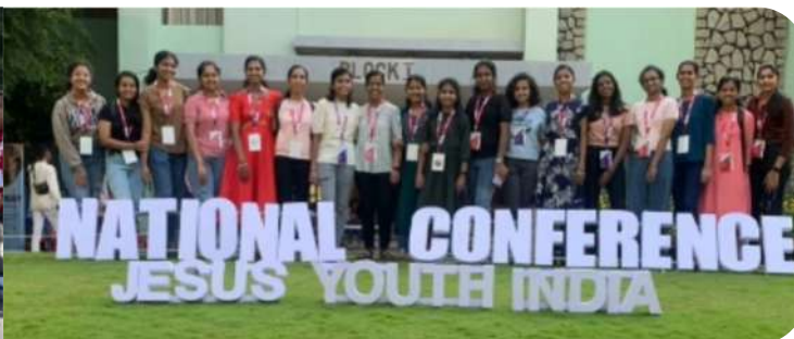
Students participated in National Conference Jesus Youth India, JAGO 2023