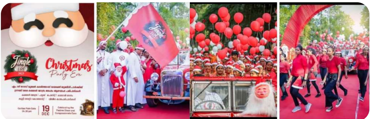
Embracing the magic of the season at Caritas College of Nursing's Christmas Fest from harmonious carol competitions to the festive flair of Buon Natale and enchanting stalls – every moment is a celebration of joy & unity

Gathering under the banner of unity – Caritas College of Nursing's Monthly General Assembly is conducted on 3rd Wednesday of every month.