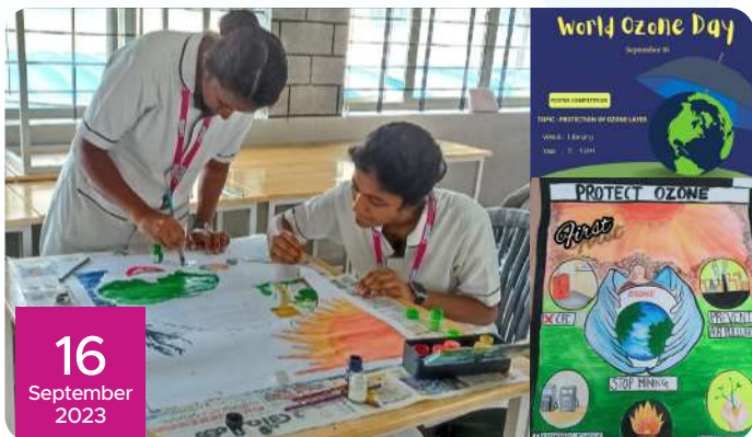
Poster competition on 'Protection of Ozone Layer' as a part of World Ozone day celebration organized by Nature Club. The winners were awarded with prizes.