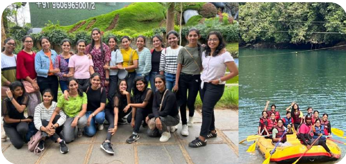
4th year B.Sc. Nursing CHIKMAGALUR, MANGALORE