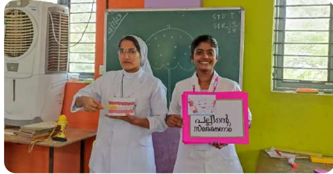
School Health Programme at Government UP School, Vedagiri organized by Department of Community Health Nursing and P B B.Sc. Nursing students