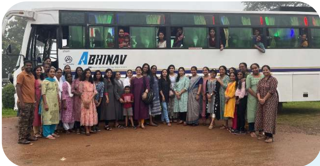
GREENBURG RESORT, IDUKKI