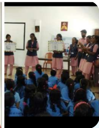
School Health Programme at St. Thomas L P School, Kaipuzha organized by 4th Year B.Sc. Nursing students and Community Health Nursing Department. Activities included health appraisal of school children, growth and development monitoring, referral services, nutritional services, and information education communication activities.