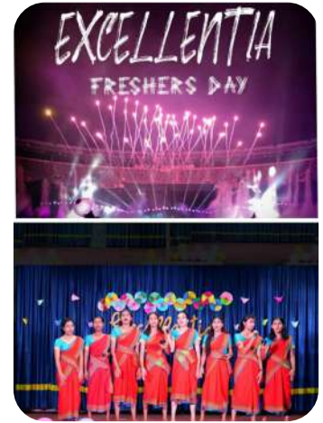
Freshers' day celebration