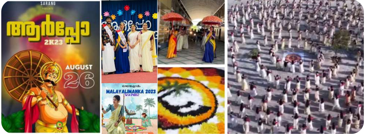
Capturing the essence of Onam at Caritas College of Nursing – where traditions dance, flavors unite, and joy echoes through every celebration